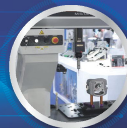
ADVANCED METROLOGY & TESTING