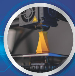
ADDITIVE MANUFACTURING & SOFTWARE