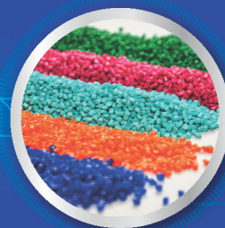
PLASTIC & RUBBER