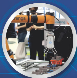
AUTOMATION & ROBOTICS